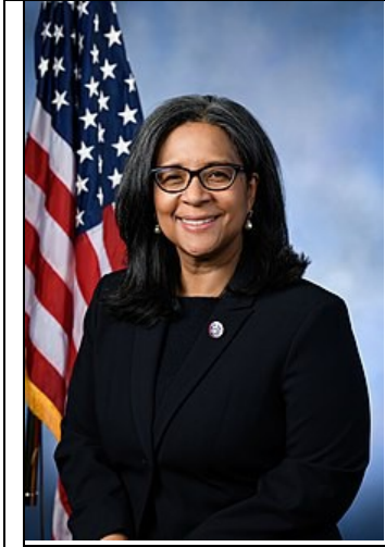
Representative Marilyn Strickland 10 th Congressional District

http://strickland.house.gov/ Twitter: @RepStricklandWA