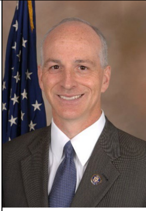
Representative Adam Smith 9 th Congressional District

https://adamsmith.house.gov/ Twitter: @rep_adam_smith