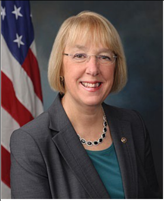
Senator Patty Murray